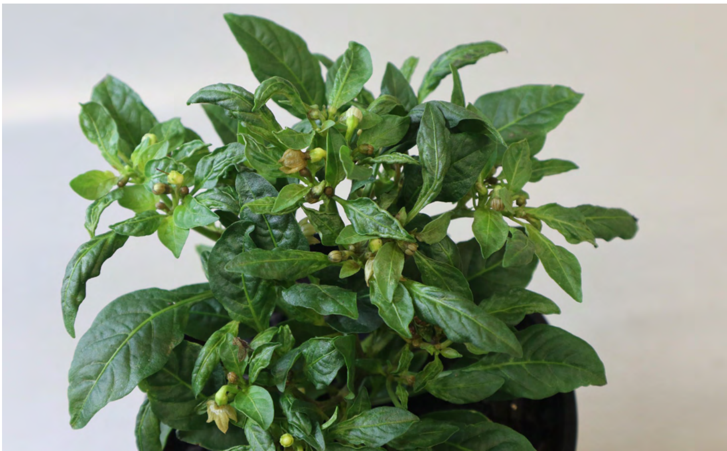
Chilli infested with broad mites.