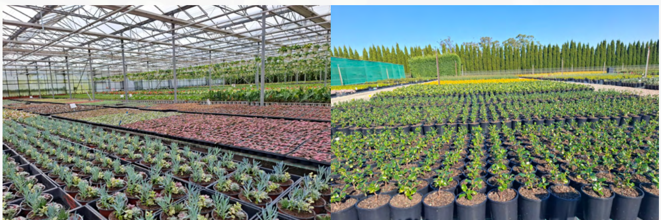
General nursery production shots showcasing strong hygiene practices.

At its core, the service is simple: get the right answer early, before issues escalate across production.