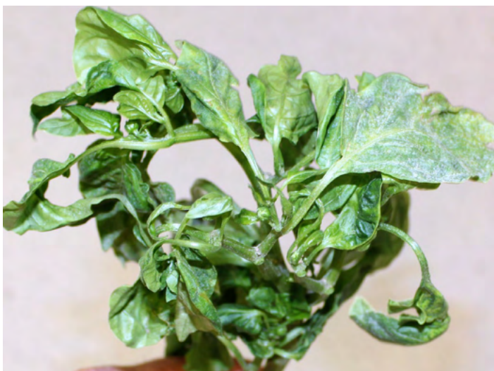
Capsicum infected with Capsicum chlorosis virus and Tomato spotted wilt virus .