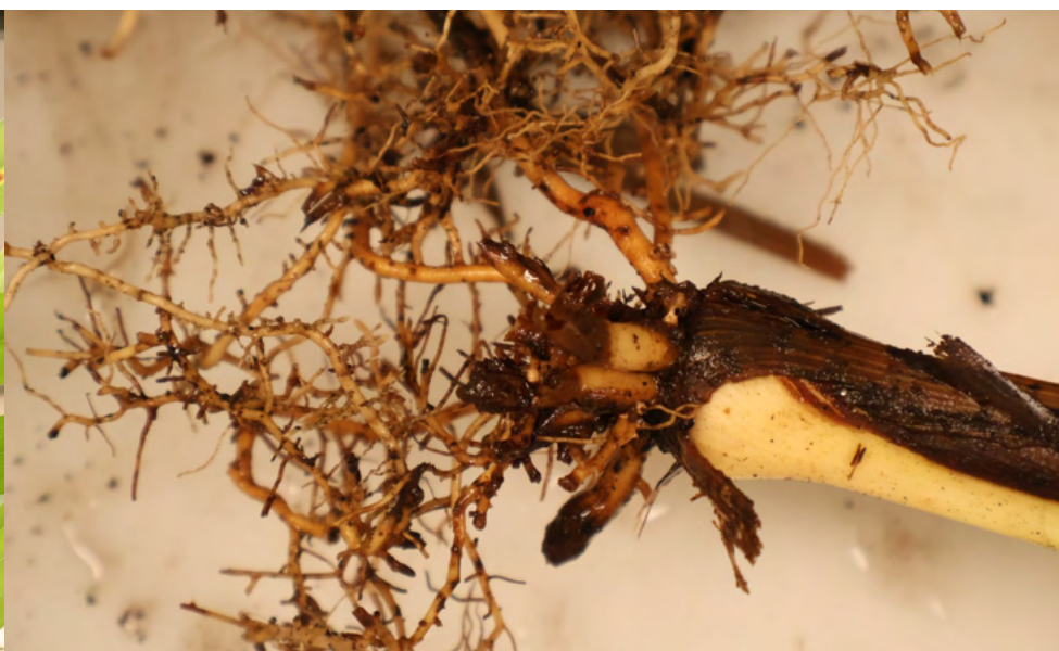
Minor leaf spots are sometimes an indication of serious root and crown rot. Kentia palm . Photos above are from the same plant