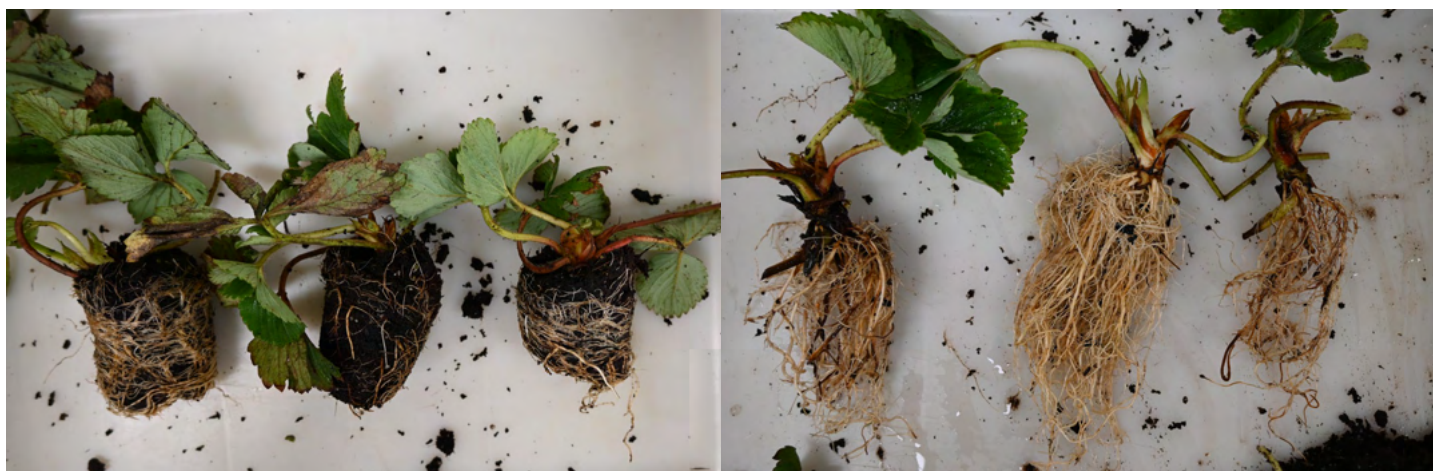
Strawberry plants can have roots that appear healthy (left), but when their roots are washed can have root rot and be infected with Phytophthora (right).

Initial diagnostic results are typically available within a few days, with reports designed to be practical and easy to apply in production settings.